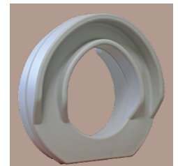
Easy to install without screws or tools