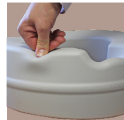
Unmatched comfort and safety